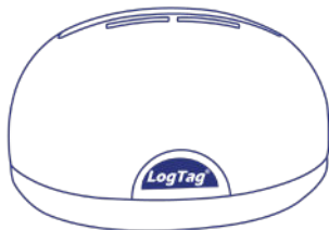
LTI-HID Interface Not Included - Optional Order Code: LTI-HID