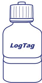
Glycol Buffer Not Included - Optional Order Code: Glycol Buffer-70ml