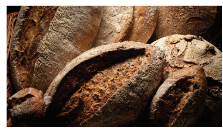
Food & Produce