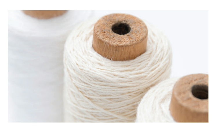
Textiles & Wood