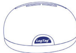
LTI HID Not Included