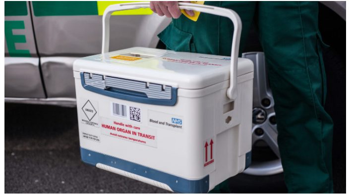
Blood and Organ Transport