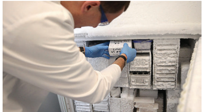
Low Temperature Conditions